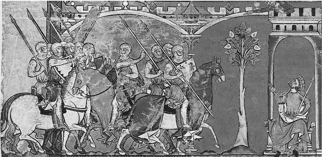
David awaits news of the battle between his armies and the armies of his son Absalom. From the Morgan Bible, c. 1240.